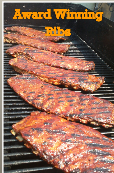
Award Winning Ribs