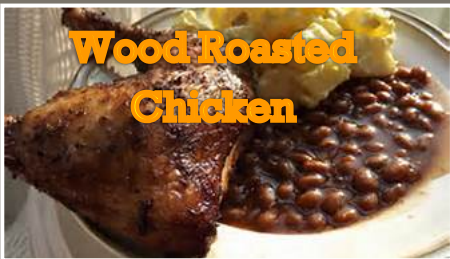
Wood Roasted Chicken